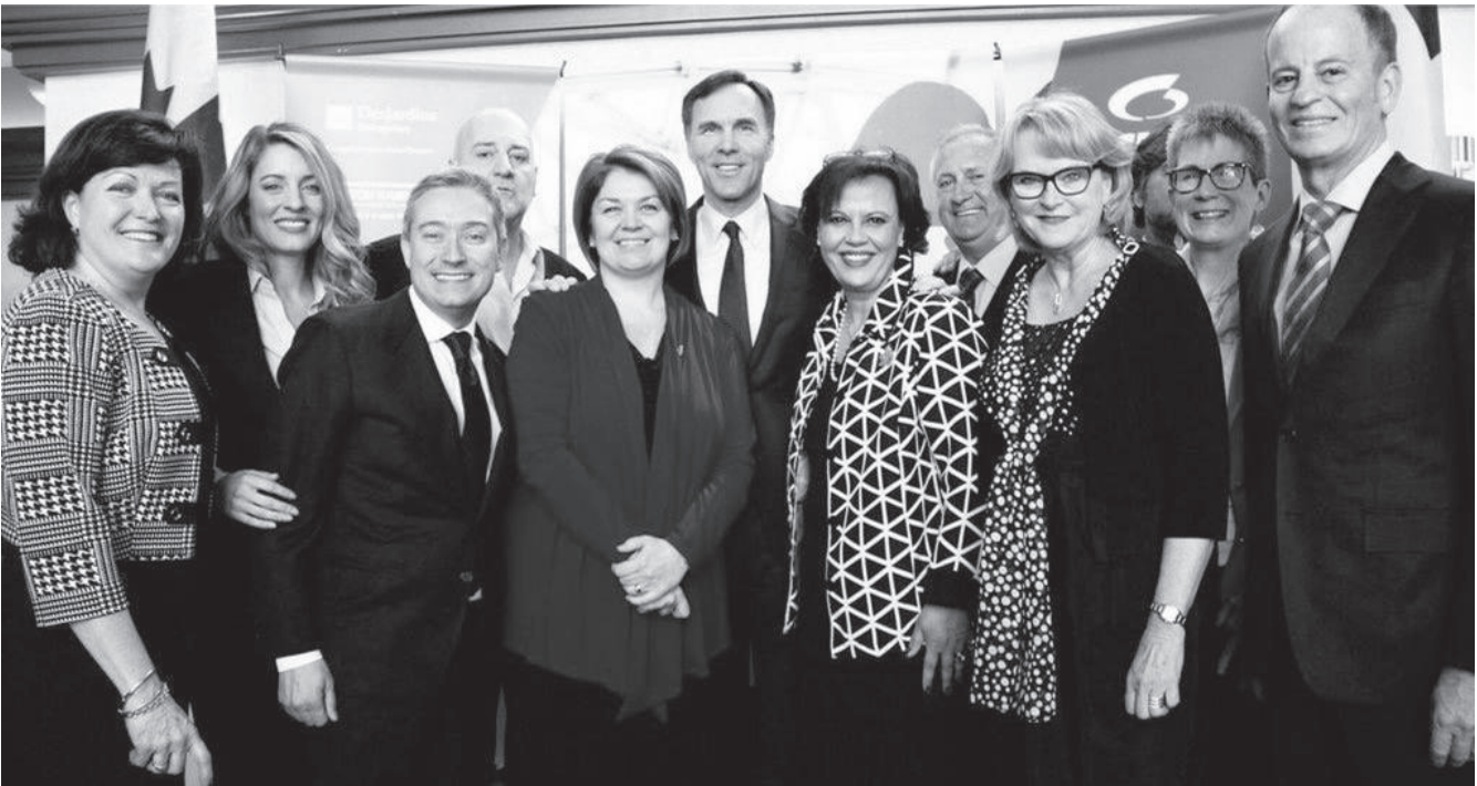
The very first conference of the 2016 Budget Tour at the Parcours du Cerf de Longueuil hosted by the Chambre de Commerce et d’Industrie de la Rive-Sud