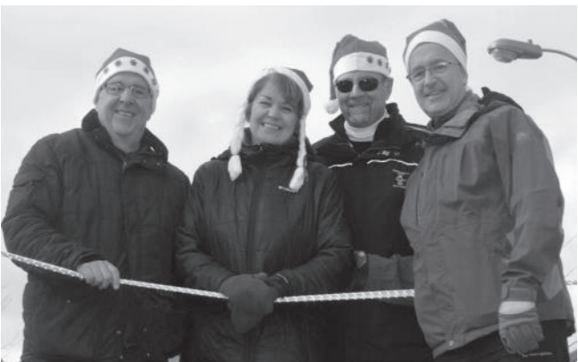
On a float at the Greenfield Park Santa Claus parade