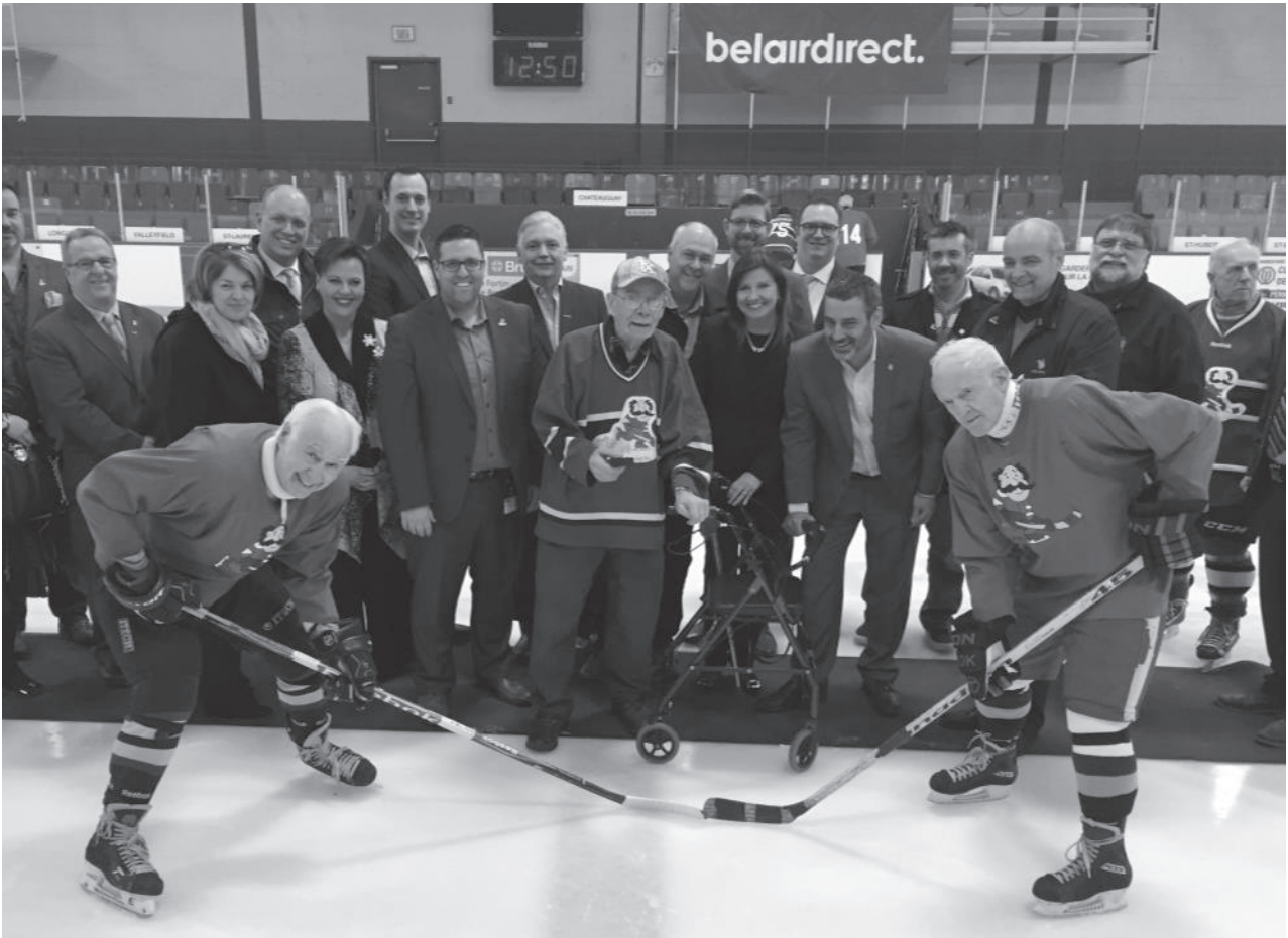
Facing off at the 13th annual South Shore Old Timers hockey tournament

What issues facing Canadians should the government focus on ?