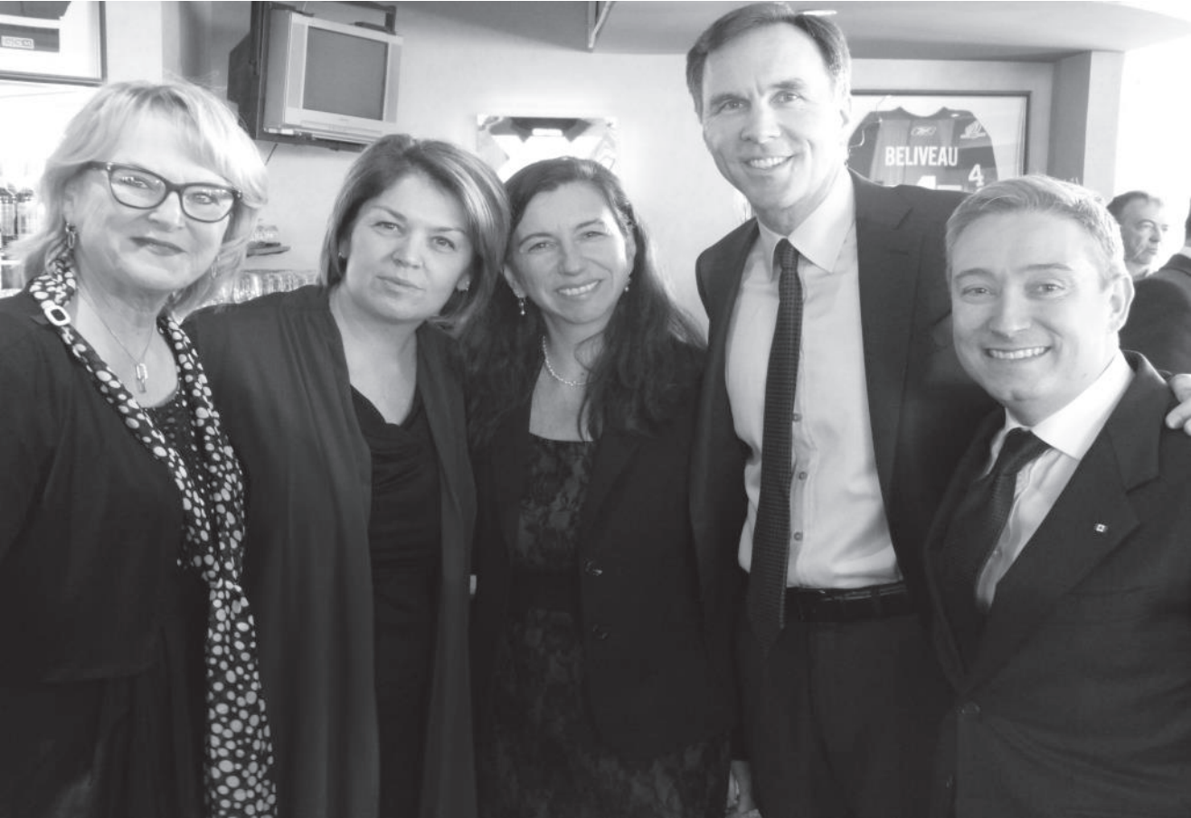
Discussing Budget 2016 with Finance Minister Bill Morneau