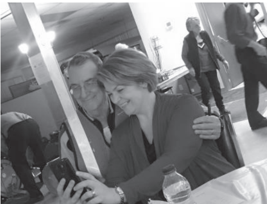
Taking pictures with the Comité Espérance Saint-Hubert