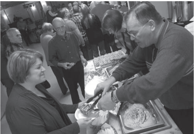
At the Comité's Crêpes et chansons dinner