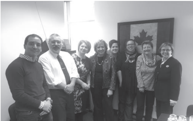
Meeting with representatives from Table Itinérance Rive-Sud, La Mosaïque, the Centre d'hébergement L'Entre-deux, and Carrefour Le Moutier